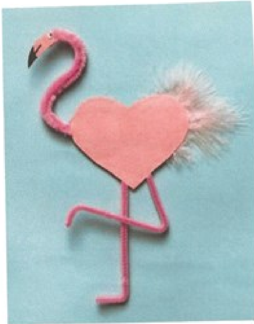
Flamingo Valentine cards