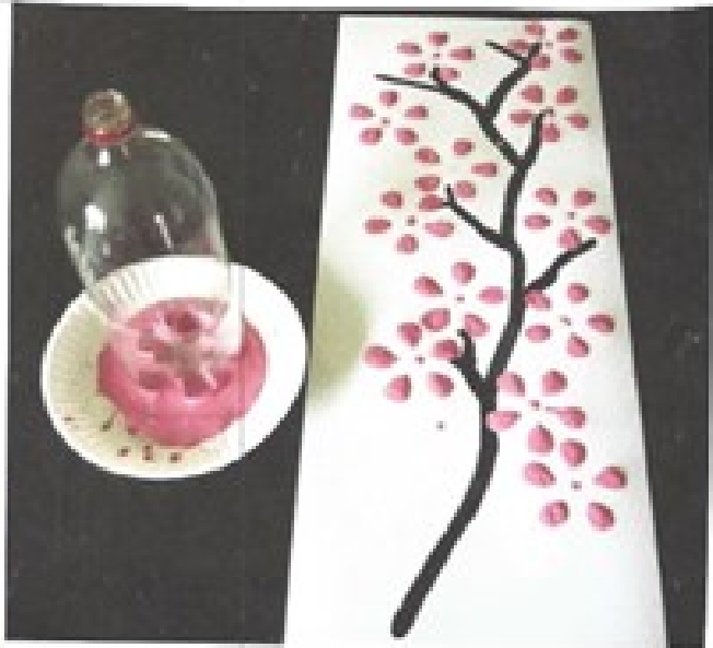
Cherry Blossom Art using a recycled soda bottle