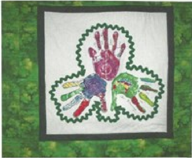
shamrock hand print craft