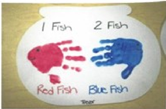
1 Fish 2 Fish Red Fish Blue Fish