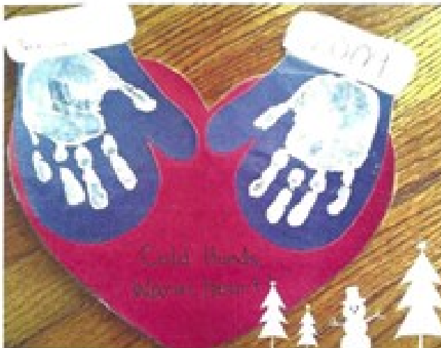
EASY KEEPSAKE CRAFT